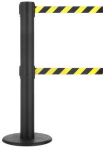
Pict. 1: GLA 89-J/17