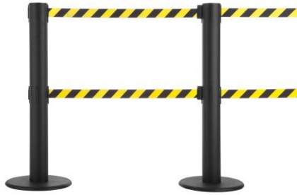
Pict. 2: barrier row of GLA 89-J/17