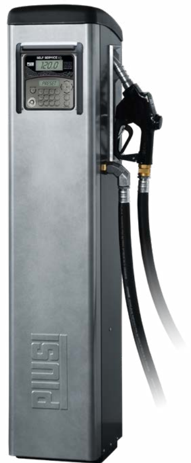
SELF SERVICE MC