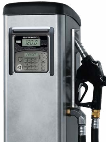
ELECTRONIC METER INTEGRATED

Upgrade your MC hardware to B.SMART with KIT UPGRADE 1.0/2018.