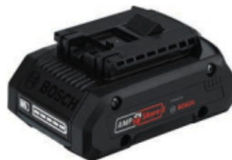
AMPShare GBA 18 V - 4.0 Ah