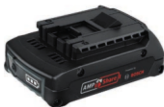
AMPShare GBA 18 V - 2.0 Ah