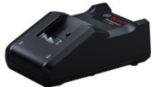
AMPShare-Ladegerät GAL 18V-40