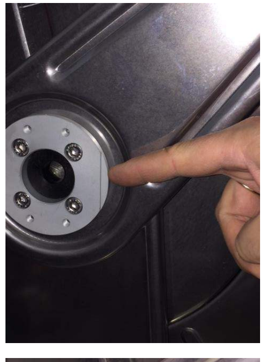
Please note milling position.