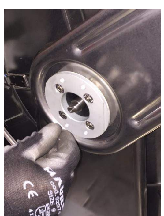
Insert the central adapter.