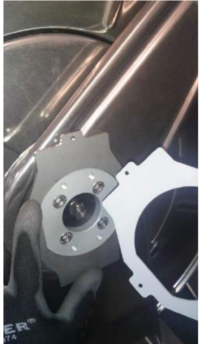
Put the stainless steel+EPDM frame.