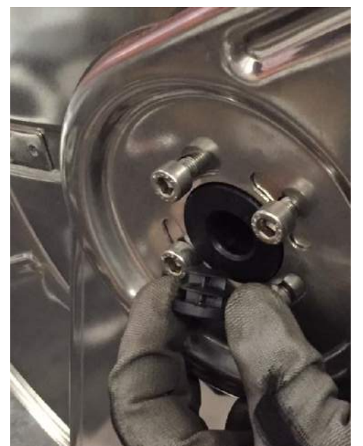
Take out the plastic plug with a screw driver.