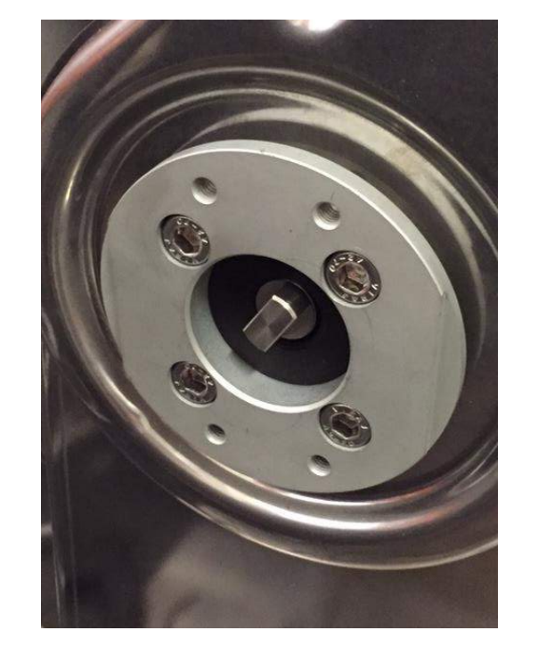
Push the adapter letting it connect to the reel.