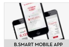
B.SMART MOBILE APP