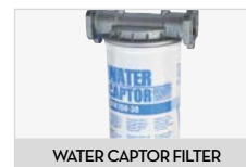
WATER CAPTOR FILTER