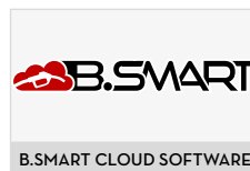
B.SMART CLOUD SOFTWARE