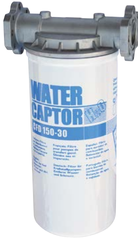
150 L/MIN WATER CAPTOR WITH WATER ABSORPTION