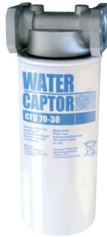
70 L/MIN WATER CAPTOR WITH WATER ABSORPTION