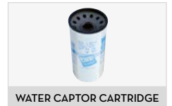
WATER CAPTOR CARTRIDGE