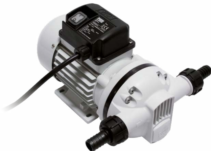
SUZZARABLU PUMP AC