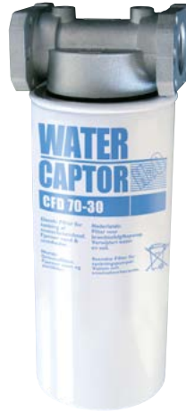
70 L/MIN WATER CAPTOR WITH WATER ABSORPTION