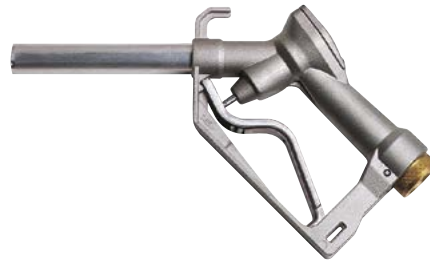
SELF 2000 DIESEL

The PIUSI SELF 2000 / SELF 3000 manual nozzles perform the maximum efficiency thanks to the low-flow resistance and the wide range of applications including transfer systems run by gravity. They are supplied with removable lever protection and connectors.